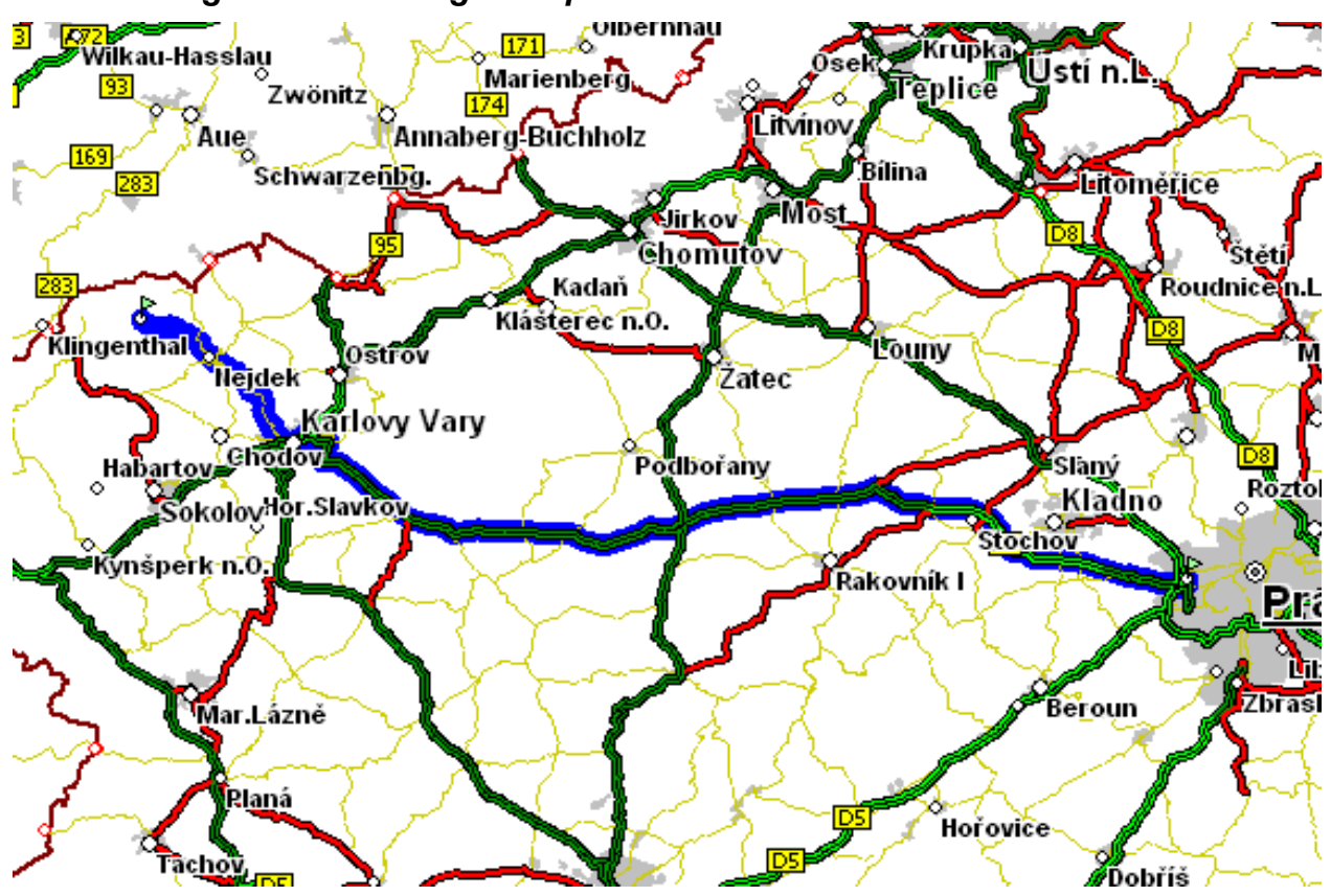
Detailed navigation from Prague Airport:

By car: From Prague follow the Karlovy Vary-highway (R6 or E48); in Karlovy Vary take road No. 220 to Nejdek, Vysoká Pec and Přebuz.