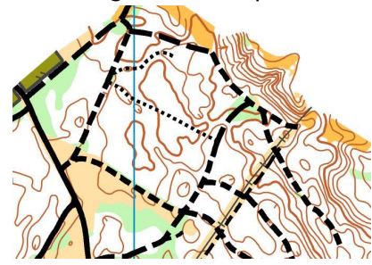
mass-start, long distance